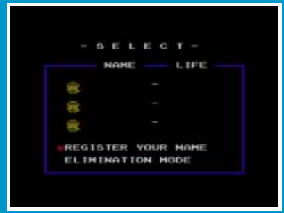
File Selection Screen